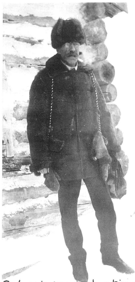
Dad out moose hunting - A.L. 1909.